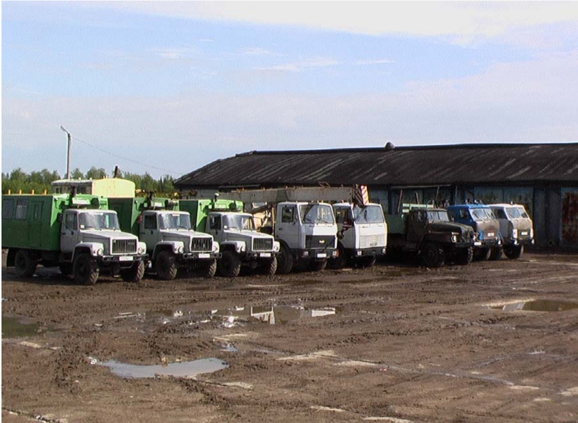
The service and supply shop area, other techniques.