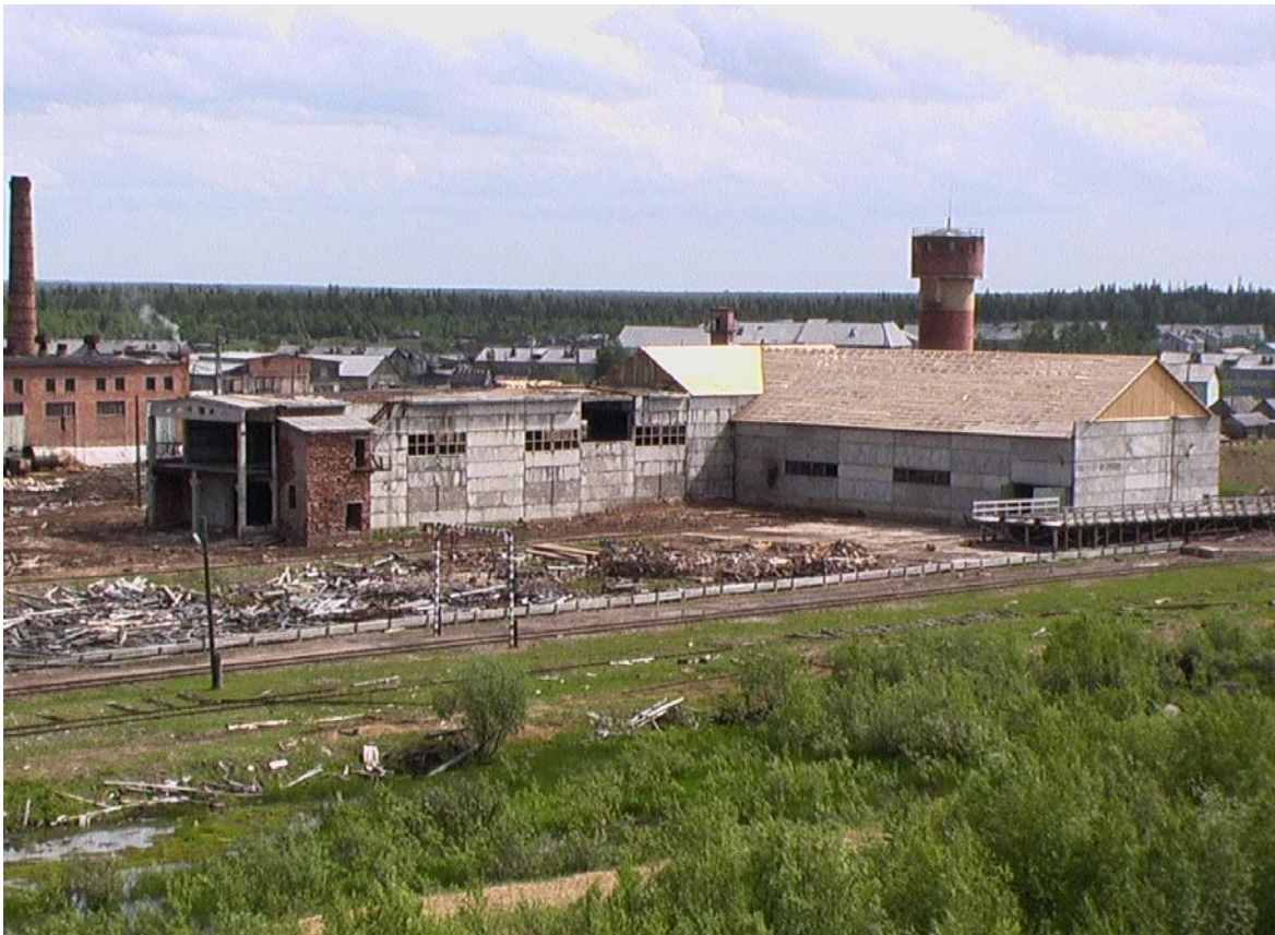
The building of the sawing workshop (on the right) with the overpass for round timber supply and null cycle for drying room and the deep processing workshop (on the left).