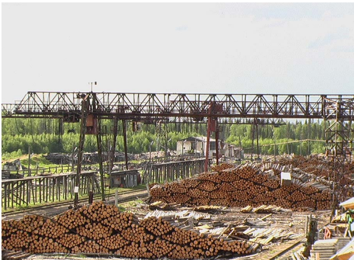
The dead-end siding, enterprise products and the building of the splinter shop (on the background).