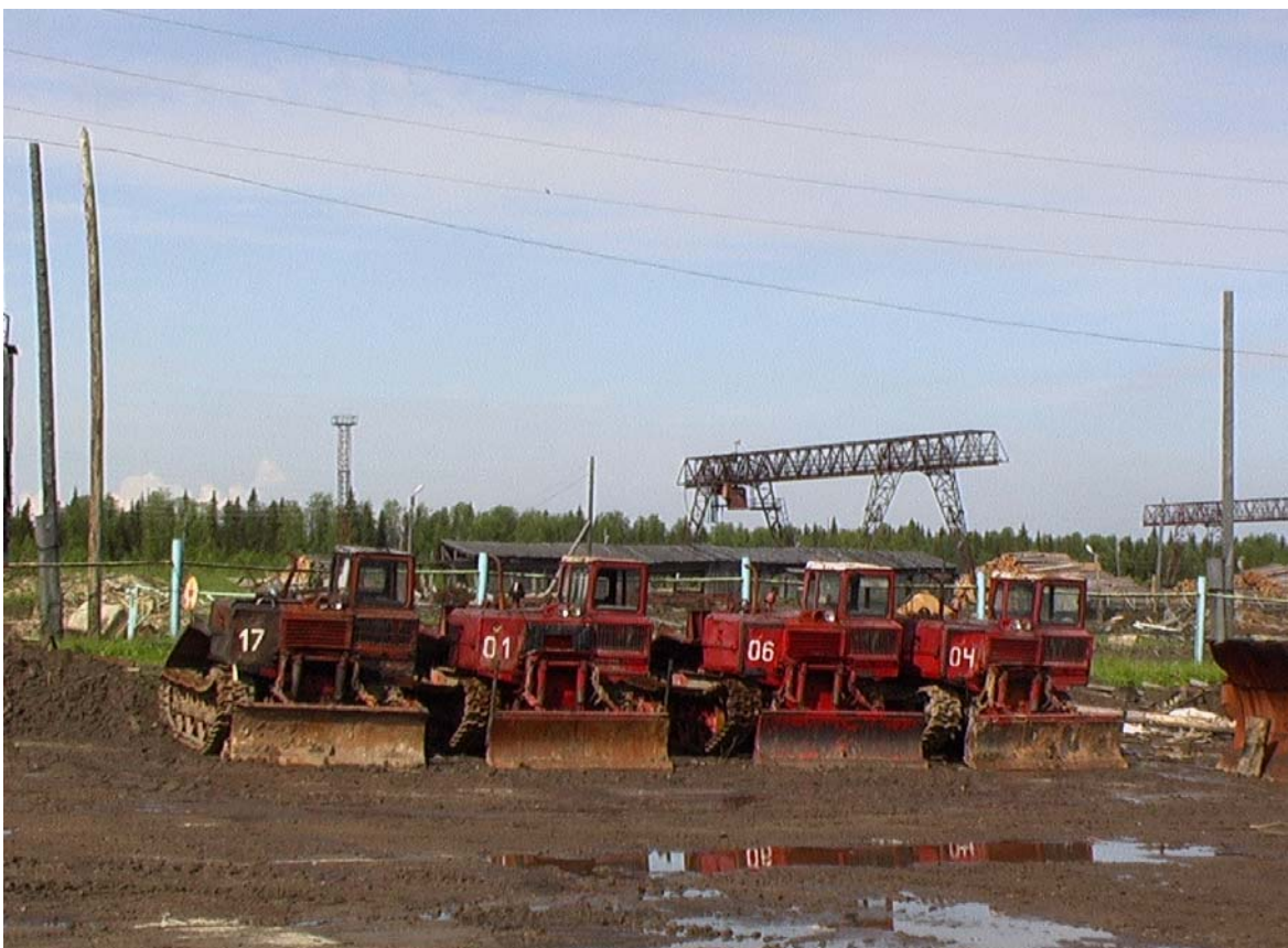
The service and supply shop area, logging tractors.