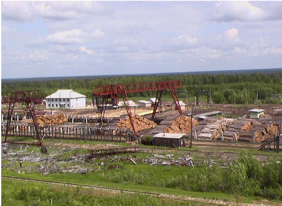
The industrial log depot, the dead-end siding and the building of the lespromchoz office.